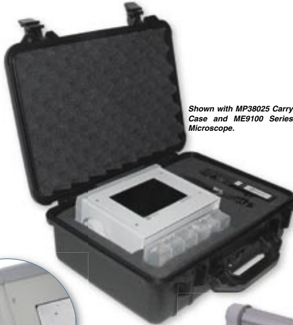
Shown with MP38025 Carry Case and ME9100 Series Microscope.