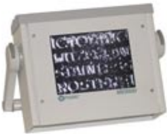
Press the side buttons to adjust the handle into a stand.